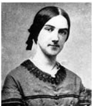
Ellen Swallow Richards