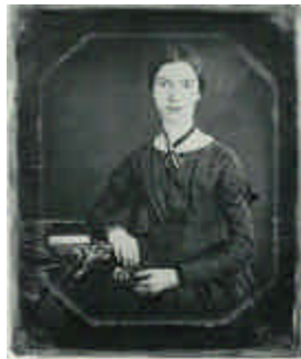
Emily Dickinson c. 1846 or 1847 The only verified photo.

Even though she died in 1886, her presence is still felt in the light-filled rooms, especially in the corner bedroom where she wrote many of her 1,800 poems while seated at a small table. There, they were discovered by her sister where Emily had stored them in the bottom drawer of her dresser.