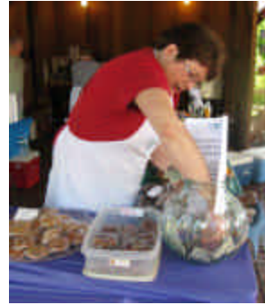
Caught with her hand in the....