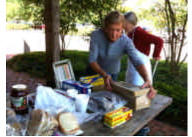
The two Anns package up the goodies.