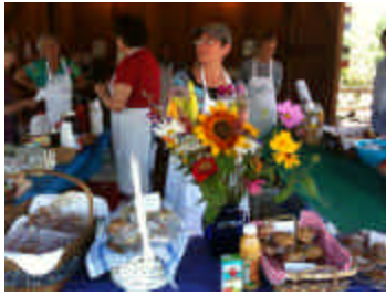
Vivian oversees a great spread.